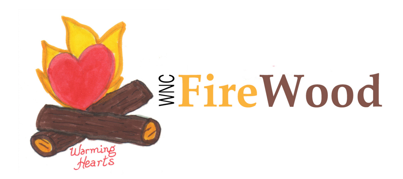
FireWood is a ministry to provide free firewood heating assistance to our qualified neighbors in Transylvania County in western North Carolina.